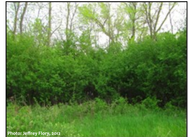
Photo: Jeffrey Flory, 2012 Dense thicket of Common Buckthorn at Hyland Park, Bloomington, MN