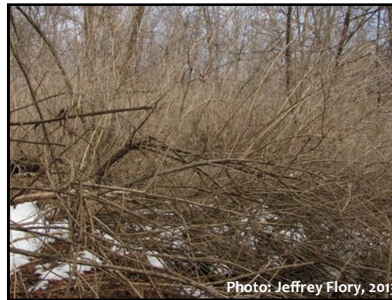
Photo: Jeffrey Flory, 2013 Non-native Honeysuckle at Crow-Hassan Park Reserve, Rogers, MN